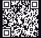
RUT204 360° VIEW

Designed for efficient machine data connectivity, the RUT204 combines native CAN FD hardware with LTE Cat 4 to enable direct and secure transmission of CAN data without external converters. Built for industrial and mobile applications, this compact router also features GNSS for asset tracking, Wi-Fi 4, Dual SIM, PoE-in, RS232, Ethernet, and a wide 9 - 57 VDC power range. Embedded RutOS and RMS support enable zero touch deployment, remote monitoring, and scalable fleet management to reduce complexity and improve operational efficiency.