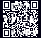
RUT271 360° VIEW

The RUT271 is a Redcap 5G router, bridging the gap between 4G and full-capacity 5G. Supporting SA architecture, this 5G router can wirelessly support up to 50 end devices and features the low latency of 5G—at affordable pricing.