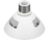
WV-QSR504M-W Mount Bracket