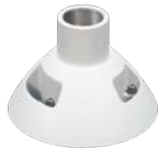
WV-QSR504F-W Mount Bracket