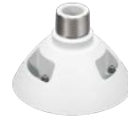
WV-QSR504M1-W Mount Bracket