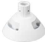
WV-QSR504-W Mount Bracket