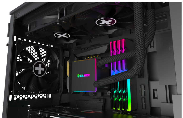
Example representation of the LQ240PRO water cooling system in a PC build.