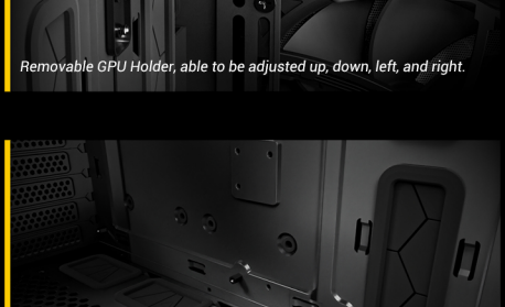
Removable GPU Holder, able to be adjusted up, down, left, and right.