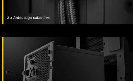
3 x Antec logo cable ties.