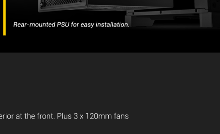
Rear-mounted PSU for easy installation.