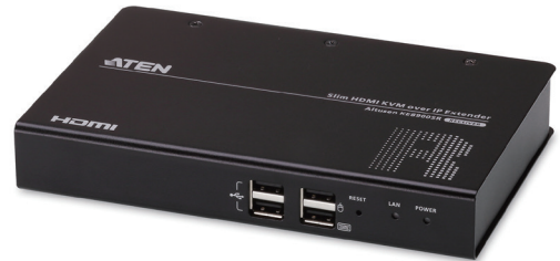
KE8900SR Front View