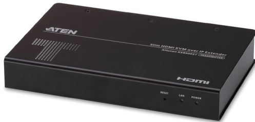
KE8900ST Front View