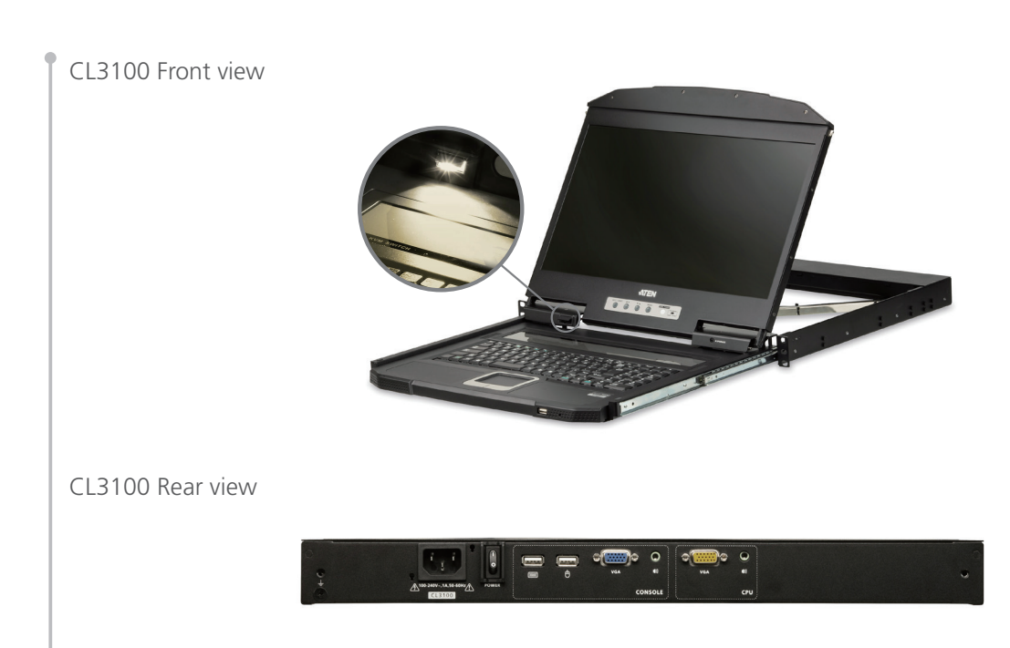
CL3100NX: 18.5" LCD screen with resolution of 1366 x 768

With a rich feature set, the CL3100 is designed to exceed the requirements for space utility optimization, adaptive deployment, and operational versatility, and is ideal for applications such as mobile live streaming in the broadcasting sector or control rooms with limited space in any industry.