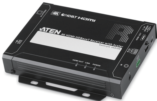
VE816R Rear View