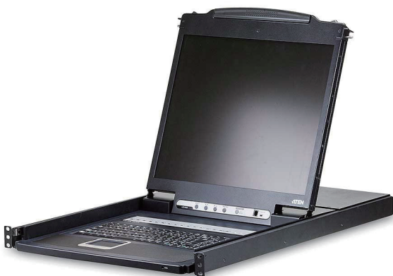
CL1316 Front view