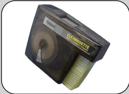
CLEANSSETTE—Optical connector cleaner in cassette design