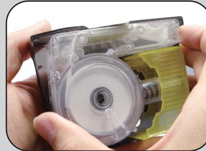
Easy to remove cleaning reel without cause any contamination