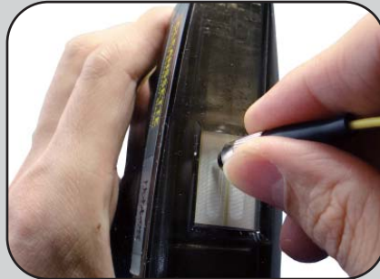
Ultra clean micro-fiber cloth captures debris and other contamination