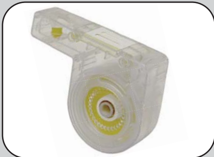
Eco-friendly and low cost double sides reel cleaning design