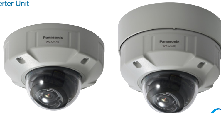
with Base Bracket