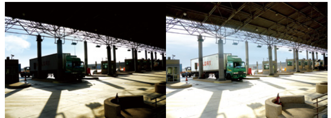
Without WDR Pro