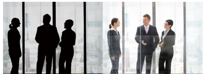
Without WDR Pro