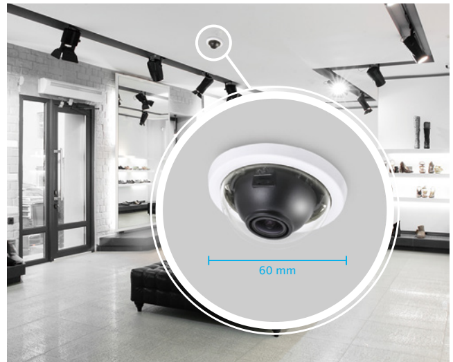
Ultra-mini Recessed-Mount Fixed Dome Network Camera