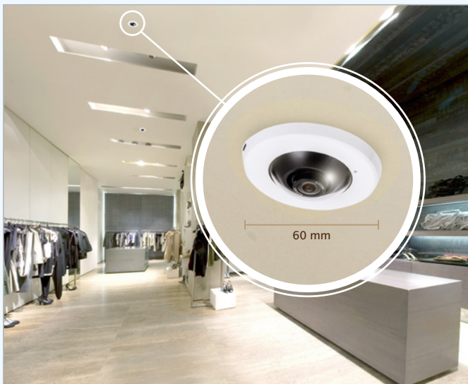
The Stylish Recessed-Mount Fisheye Network Camera