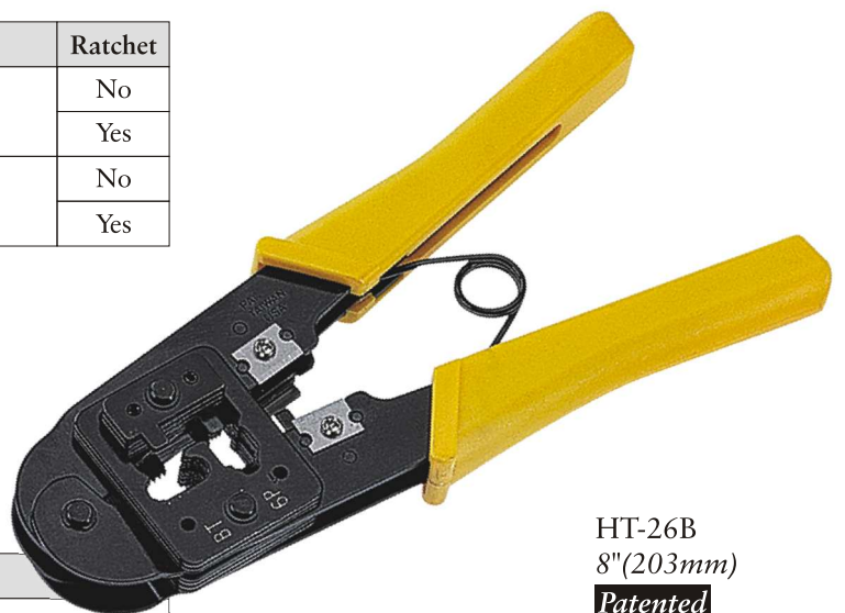
HT-26B 8"(203mm) Patented

Replacement blade: HT-200SC Use with HT-S501A/HT-S501B for stripping UTP/STP round wire. (Page 8)